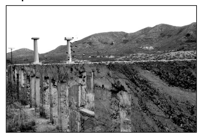
Stop 2 – The Old School

The Gleeson School opened in 1918, and was a massive two-story building with an arched entryway. The bottom floor contained storerooms while the top floor had classrooms, often used for community meetings and other functions after school hours. There were as many as four teachers, and scores of students, although the numbers varied greatly depending on the year. The last classes were held in 1945, and parts were removed for construction and renovation elsewhere. The wooden floors, for instance, were torn out and used to renovate Tombstone's Crystal Palace.