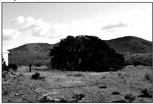
Stop 4 – The Jail Tree

When Gleeson began, local miscreants were locked up at the "Jail Tree", which is next to the wash, between the hospital and the Bono building. A cable was secured around the massive trunk of the oak, and prisoners were chained by the wrist to the cable. The jail was cleaned only when water ran down the wash and carried away the prisoners' refuse. Passing children used to throw rocks at the prisoners. The jail tree was replaced by a temporary wooden jail in 1905, and ultimately by the concrete jail in 1910.